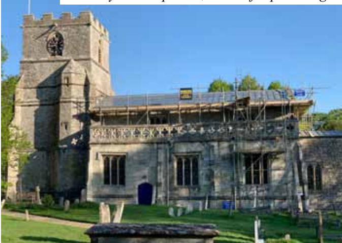
St. Mary's Bishopstone, the roof repairs begin

to add, to the farming community!) resulted in a sterling show of how deep the gathered's pockets were.